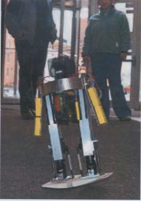
MIT's "Toddler" is no-frills, but its brain enables it to learn to walk (right)